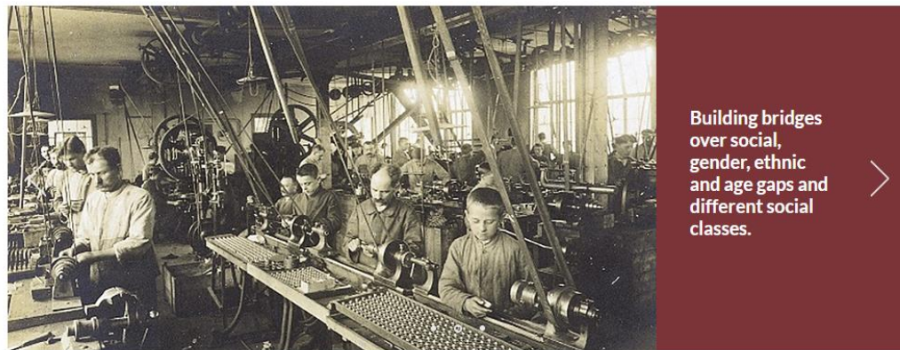
VIRTUAL REALITY ARCHIVE LEARNING (ViRAL)